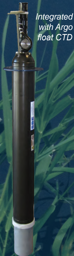
Integrated with Argo float CTD