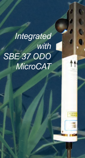
Integrated with SBE 37 ODO MicroCAT