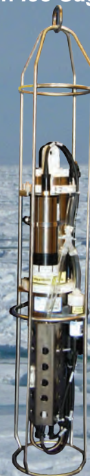
SBE 19plus V2 SeaCAT CTD in Ice Cage