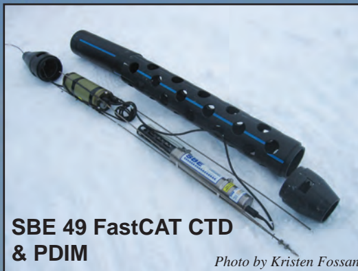
SBE 49 FastCAT CTD & PDIM