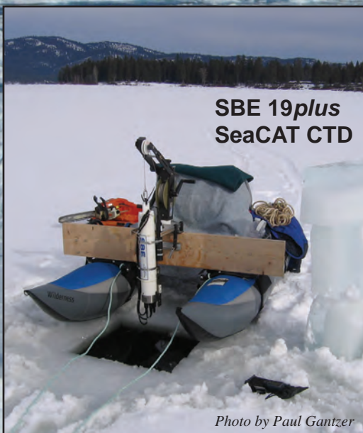
SBE 19plus SeaCAT CTD