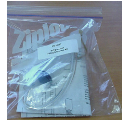
50087 conductivity cell filling & storage kit