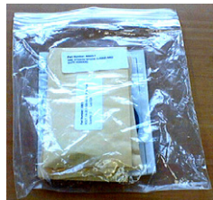
60021 spare o-ring & hardware kit