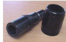
17044 2-pin dummy plug & 17043 locking sleeve