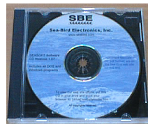
Software, & electronic copies of software manuals & user manual