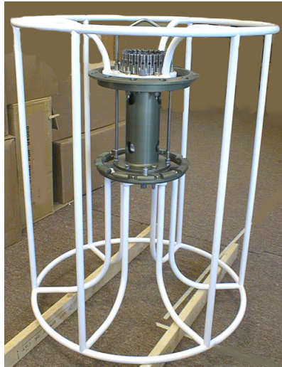
12-bottle Carousel (Note: When feasible, frame is shipped assembled; however, feasibility depends on shipping size limitations for particular destination)