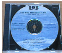
Software, & electronics copies of software manuals & user manual