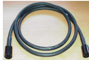
17198 SBE 32 to 9plus, 17plus, or AFM

90199 vertical CTD replumbing kit (to convert CTD plumbing for vertical CTD orientation when used without Carousel) – photo not available