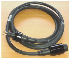
17120 or 171090 sea cable extension cable (leave extension connected to instrument, & make sea cable connection at end of extension for easy access)