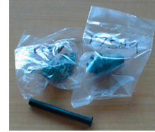
50086 Sea Cable connector