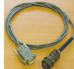
801422 NMEA Input Interface test cable