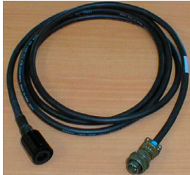
80915 SBE 36 to PDIM test cable