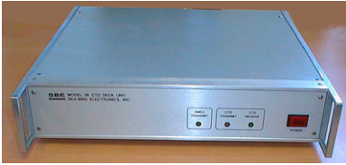
SBE 36 CTD Deck Unit