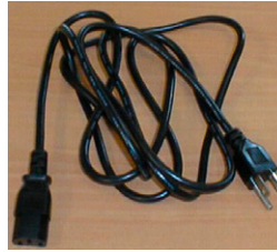
SBE 36 power cable