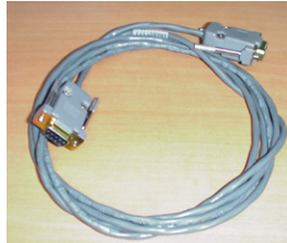
171887 SBE 36 to computer cable