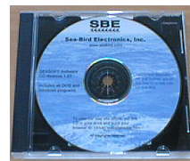
Software, & electronic copies of software manuals & user manual