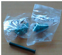
50173 NMEA Input connector