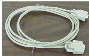
171887 I/O Cable (included with SIM)