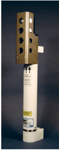
SBE 37-IMP (AF24173 Anti-Foulant Devices installed at Sea-Bird)