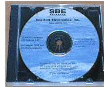
Software, & electronic copies of software manuals & user manual