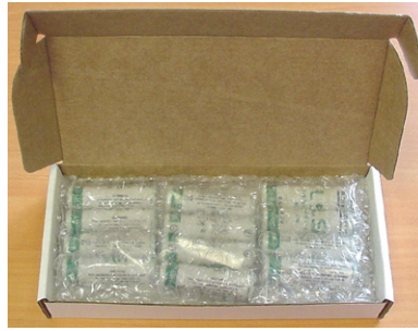
50441 batteries (12 AA lithium batteries)