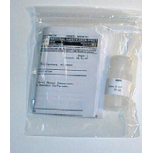
50091 conductivity cell cleaning solution (Triton-X)