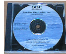
Software, & electronic copies of software manuals & user manual