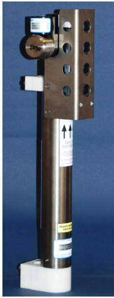
SBE 37-IMP-IDO (AF24173 Anti-Foulant Devices installed at Sea-Bird)