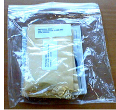
60055 spare hardware & o-ring kit