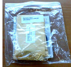
60055 spare hardware & o-ring kit