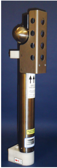
SBE 37-IMP-ODO (AF24173 Anti-Foulant Devices installed at Sea-Bird)