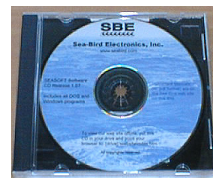
Software, & electronic copies of software manuals & user manual