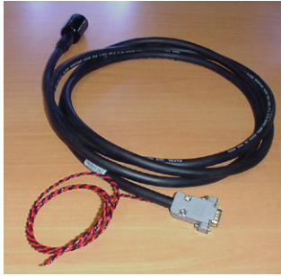
801385 I/O cable