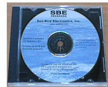
Software, & electronic copies of software manuals & User manual