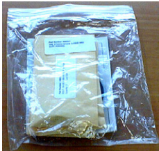
60033 spare parts kit