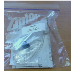
50087 conductivity cell filling & storage kit