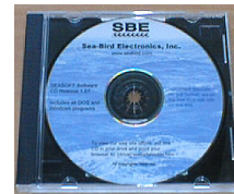
Software, and Electronic Copies of Software Manuals and User Manual