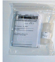
50091 conductivity cell cleaning solution (Triton-X)