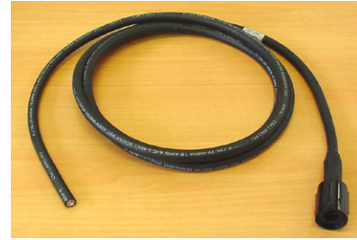
17031 I/O cable