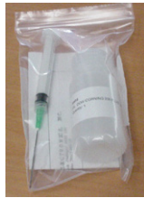
50025 pressure sensor oil refill kit