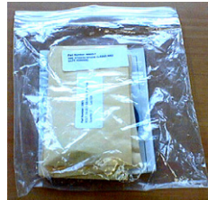
(for SBE 54 with internal batteries) 60021 spare o-ring & hardware kit