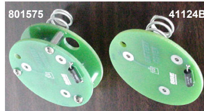
(battery cover plates for SBE 54 with internal batteries) 801575 – for use with lithium DD batteries 41124B – for use with alkaline D batteries