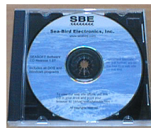
Software, & electronic copy of user manual