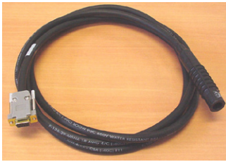
801225 I/O cable