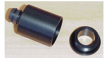
Anti-foulant device cup Anti-foulant device cap

* Previous versions of the kit contained white anti-foulant device caps (231505) and cups (231513), with dimensions identical to the black caps and cups.