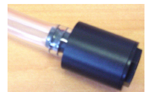
Tygon tubing and anti-foulant device cup and cap