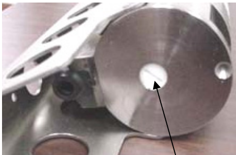
Standard pressure sensor port plug

At Sea-Bird, a pressure port plug with a small (0.042-inch diameter) vent hole in the center is inserted in the pressure sensor port. The vent hole allows hydrostatic pressure to be transmitted to the pressure sensor inside the instrument.