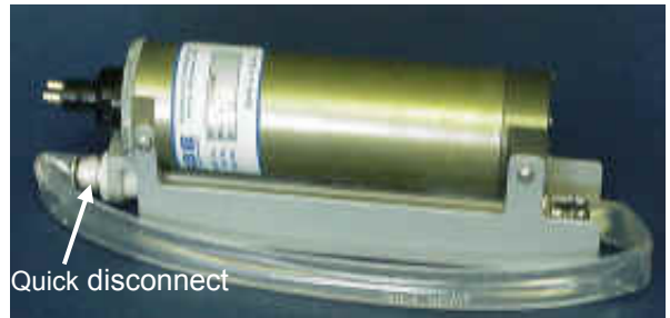
SBE 4C; 4M is similar, but does not include Quick disconnect

SBE 4 series conductivity sensors are modular, self-contained instruments that measure conductivity from 0 to 7 S/m (Siemens/meter), thus covering the full range of lake and oceanic applications. The sensors (Version 2; S/N 2000 and higher) have electrically isolated power circuits and optically coupled outputs to eliminate any possibility of noise and corrosion caused by ground loops. Interfacing is also simplified by the square-wave variable frequency output signal (nominally 2.5 to 7.5 kHz, corresponding to 0 to 7 S/m). The sensors offer improved temperature compensation, smaller fit residuals, and faster turn-on stabilization times. Supply voltage range is 6 to 24 volts.