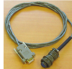
801422 NMEA Interface test cable