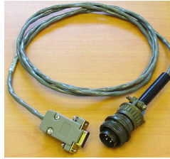
801429 Remote Out Interface test cable