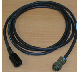
80915 11 plus to 9 plus test cable