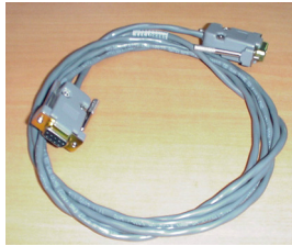
171890 9600 Baud Uplink cable