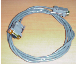
171887 Computer to 11 plus cable for SBE 11 Interface (RS-232) & Modem Channel connectors (2 cables / Deck Unit)