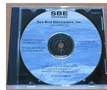
Software, & electronic copies of software manuals & user manual