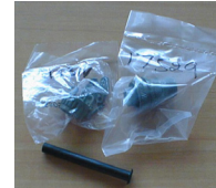
60040 Spare connector & hardware kit (Sea Cable, NMEA, & Surface PAR connectors) (1 connector & hardware shown)