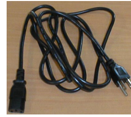
11 plus power cable