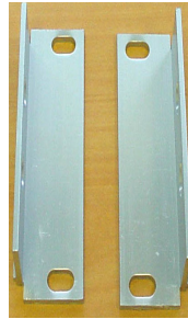
30017 rack mount kit (screws not shown)