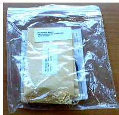
60021 spare battery end cap o-ring & hardware kit