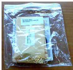
50051 o-ring & hardware kit