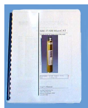
SEARAM user manual