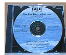
Software, & electronic copies of software manuals & user manual