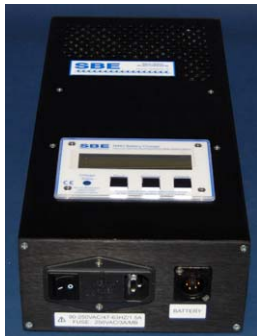
90504 NiMH battery charger, 801512 battery pack, 801509 battery charger cable, & 17015 AC power cable