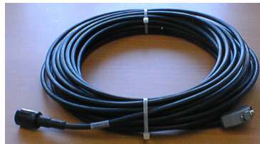
801380 data I/O cable (connection to computer serial port)