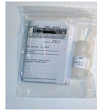
50091 conductivity cell cleaning solution (Triton-X)