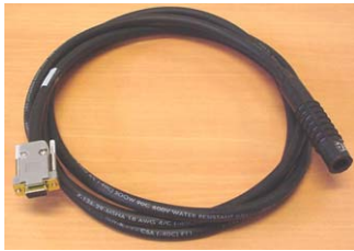
801225 I/O cable