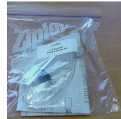
50087 conductivity cell filling & storage kit