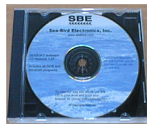
Software, & electronic copies of software manuals & user manual