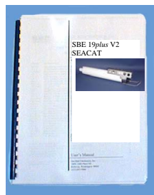
SBE 19plus V2 Manual