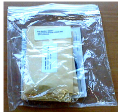
60021 spare o-ring & hardware kit