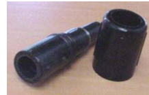
17044 2-pin dummy plug & 17043 locking sleeve