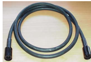
17198 SBE 32 to 9plus, 17plus, or AFM

90199 vertical CTD replumbing kit (to convert CTD plumbing for vertical CTD orientation when used without Carousel) – photo not available