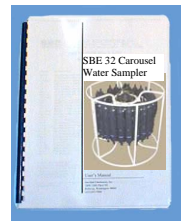
SBE 32 user manual