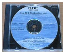
Software, & electronics copies of software manuals & user manual