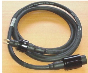
17120 or 171090 sea cable extension cable (leave extension connected to instrument, & make sea cable connection at end of extension for easy access)