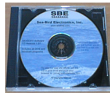
Software, & electronic copies of software manuals & user manual