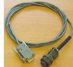
801422 NMEA Input Interface test cable