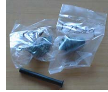
50086 Sea Cable connector