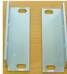
30617 rack mount kit (screws not shown)