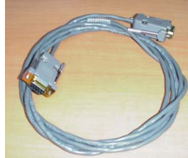
171887 SBE 36 to computer cable