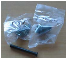
50173 NMEA Input connector