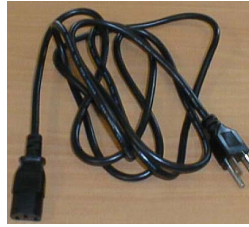
SBE 36 power cable