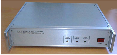
SBE 36 CTD Deck Unit