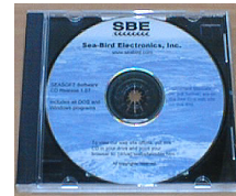
Software, & electronic copies of software manuals & user manual