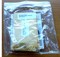
60050 spare hardware & o-ring kit