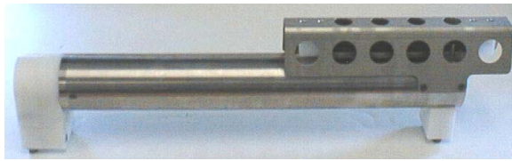
SBE 37-IM (AF24173 Anti-Foulant Devices installed at Sea-Bird)