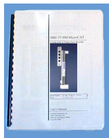
MicroCAT user manual