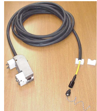
Inductive Cable Coupler (ICC) (optional with SIM, one per mooring)