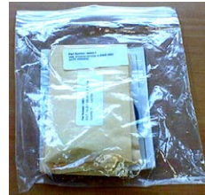
60055 spare hardware & o-ring kit