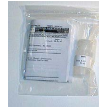
50091 conductivity cell cleaning solution (Triton-X)