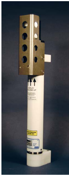
SBE 37-IMP (AF24173 Anti-Foulant Devices installed at Sea-Bird)