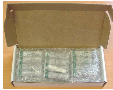
50441 batteries (12 AA lithium batteries)