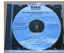
Software, & electronic copies of software manuals & user manual