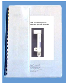
SBE 39-IM User Manual