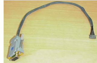
801579 RS-232 Cable (for uploading data through internal connector)