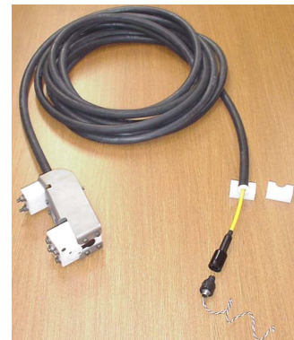
Inductive Cable Coupler (ICC) (optional with SIM, 1 per mooring)