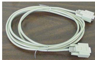
171887 I/O Cable (included with SIM)