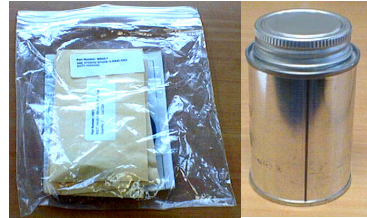
60044 spare parts kit – includes spare O-rings & desiccant bags