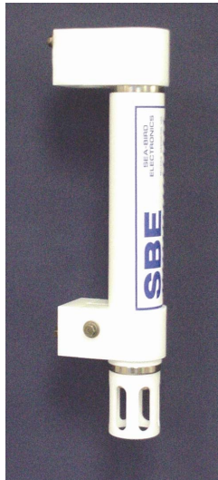
39-IM - Plastic housing, External thermistor