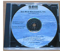
Software, & electronic copies of software manuals & user manual