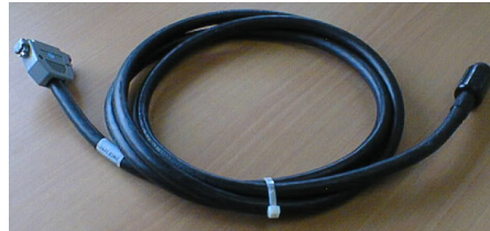
801434 test cable – connects SBE 44 to computer to test serial communication through SBE 44's RS-232 bulkhead connector