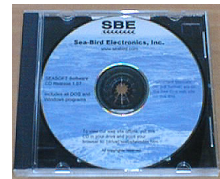
Software, & electronic copies of software manuals & User manual