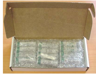
50441 batteries (12 AA lithium batteries)