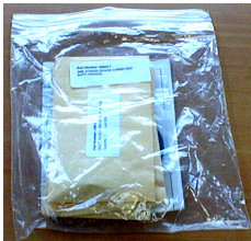
60033 spare parts kit