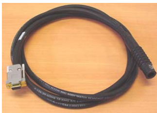
801225 I/O cable