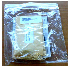
(for SBE 54 with internal batteries) 60021 spare o-ring & hardware kit