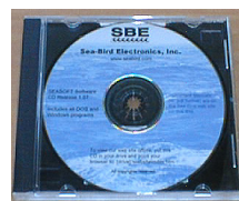
Software, & electronic copy of user manual