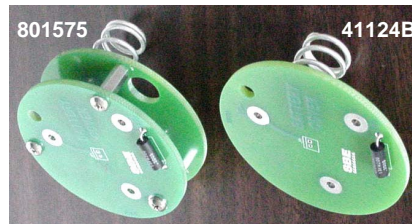
(battery cover plates for SBE 54 with internal batteries) 801575 – for use with lithium DD batteries 41124B – for use with alkaline D batteries