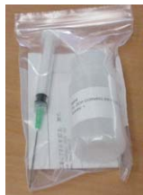
50025 pressure sensor oil refill kit