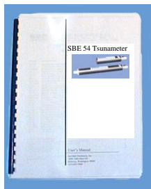
SBE 54 manual